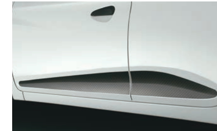
Side Body Molding Graphics