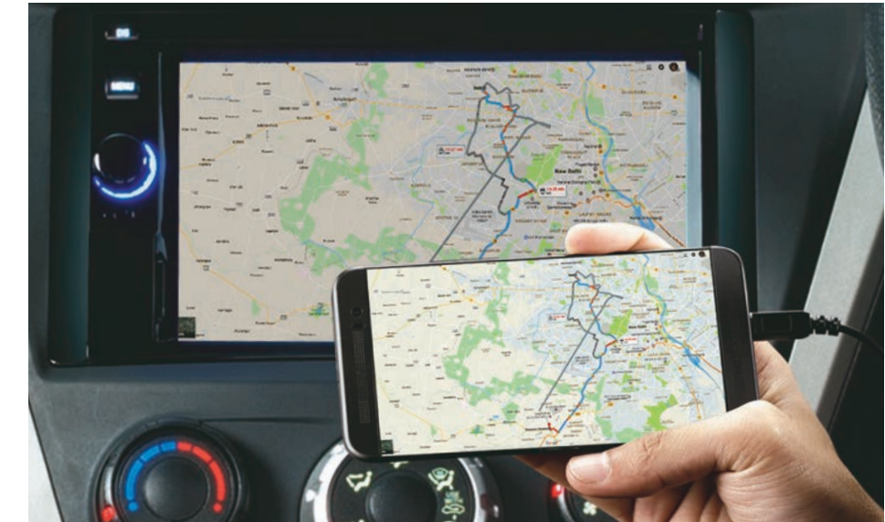
6.2 Touch Screen AV System with Phone Link

An ideal blend of style, performance and economy, the Hyundai EON Sports Edition is the perfect choice for those who seek that extra value & style. When it comes to comfort or convenience, the Hyundai EON boasts of both in equal measure.