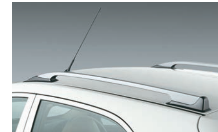
Sporty Roof Rails