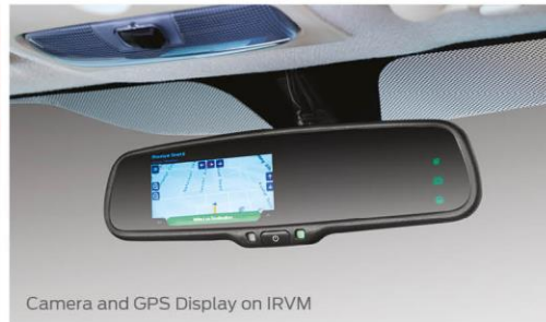
Camera and GPS Display on IRVM