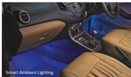
Smart Ambient Lighting