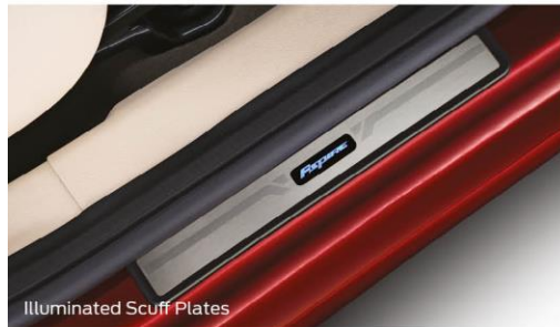
Illuminated Scuff Plates

Make your Figo Aspire even more unique with its range of accessories. We've got what you need when it comes to style.